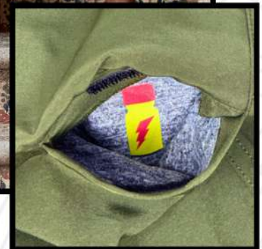
Built-In Poppers Pocket